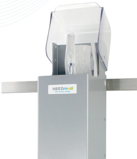
Mounting on standard rail

Aluminum, powder-coated in light grey (RAL 7035) other RAL colors on request